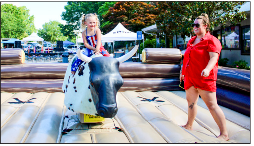
As if bouncy houses, facepainting and cornhole weren't enough, the Fairgrounds Fireworks also featured mechanical bull riding that was a big hit with children in the lead-up to the colorful display.