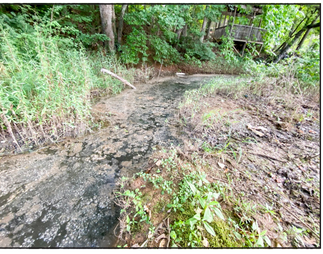
This unnamed creek was contaminated with sewage spillover after a private lift station failed in the Hawks Harbor area of Lake Chatuge. The leak was contained July 3.

sewage, which occurred last See Sewage Leak, Page 7