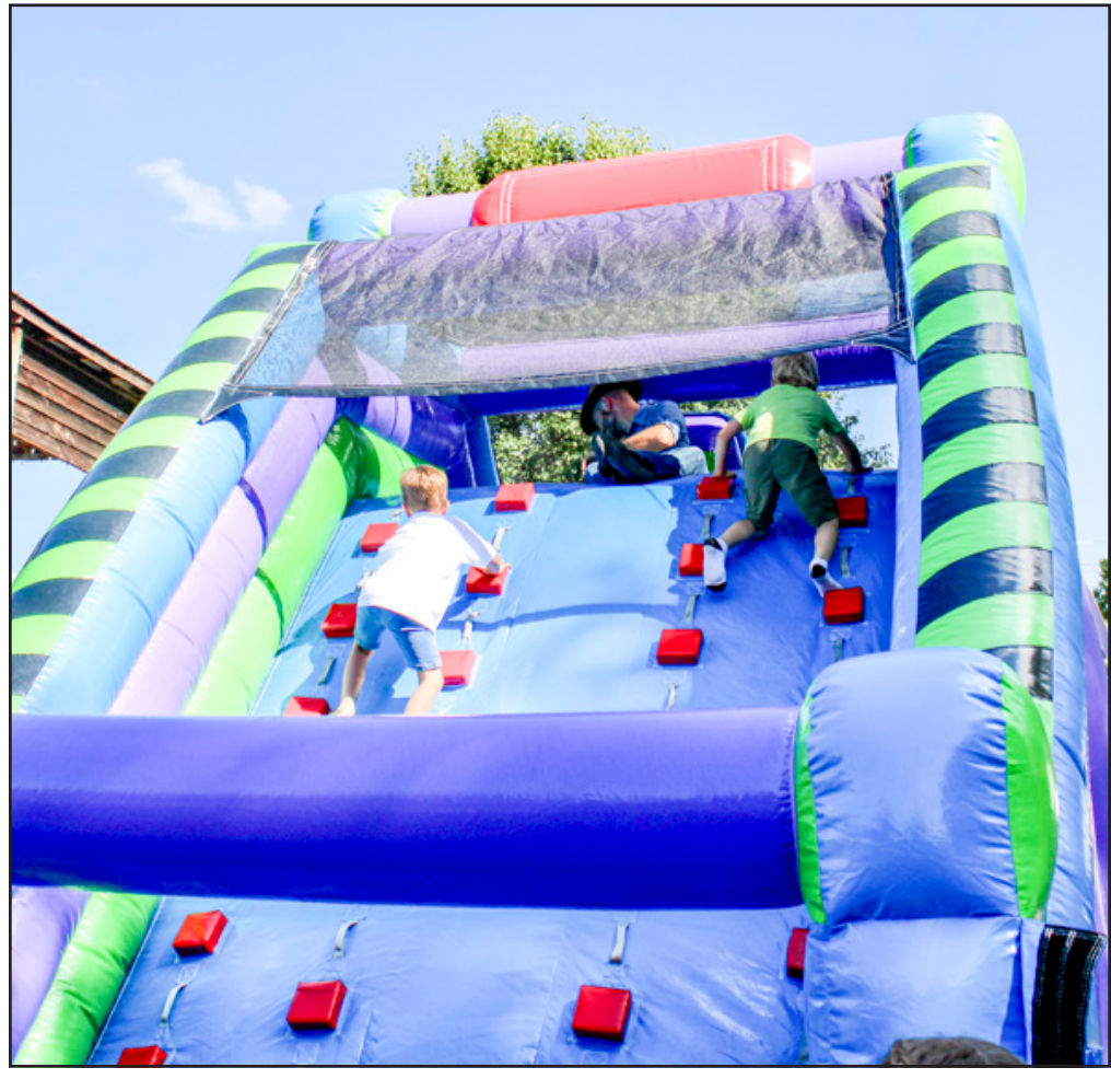
Family comes first at the annual Fairgrounds Fireworks, where Calvary Baptist Church pro-vided plenty for kids to do in 2024.