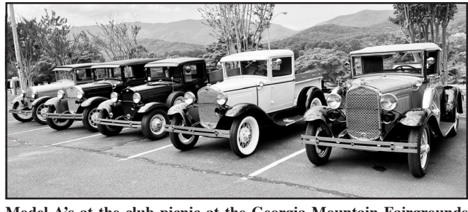
Model A's at the club picnic at the Georgia Mountain Fairgrounds Paris pavilion

The Brasstown Valley A's local chapter of the Ford Model A Club of America will hold the monthly members